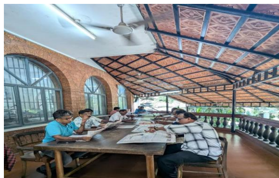
Fig.5 Reading Space in Mananchira Public Library

The recent developments incorporate Kerala's architectural style, with sloping tiled roofs and an inviting façade that harmonizes with the surrounding Mananchira Square's historical character. The exterior structure features a sloped, multi-tiered tiled roof, reflecting Kerala's indigenous architectural style and providing effective rainwater drainage, which is well-suited for the region's monsoon climate. This design element not only enhances the building's aesthetic appeal but also connects it to Kerala's architectural heritage.