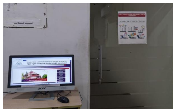
Fig. 2 Digital Reference Centre in Mananchira Public Library and Research Centre

resources, making rare and invaluable materials easily available to a wider audience. By enabling efficient data retrieval and digital documentation, this process has improved the preservation of resources that are vulnerable to physical degradation, loss or damage over time. In the modern era, the integration of digital archives within libraries has transformed traditional methods of information storage, retrieval, and dissemination, particularly within culturally rich institutions like the Mananchira Public Library. The library's transition to digital archives represents a significant move toward expanding accessibility, promoting preservation, and fostering inclusivity for diverse user demographics, including students, researchers, and the general public. Since the inauguration of the digital section in 2022, officiated by Minister Mohammed Riyas, the library has strategically leveraged technology to digitize and document collections, thereby safeguarding against the degradation of physical materials.