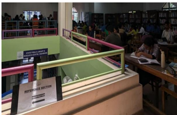
Fig. 7 Reference Section in Mananchira Public Library

The library's spatial reconfiguration, such as the provision of a reference floor on the third level with a seating capacity of 150, caters to youth preparing for competitive exams, making it a critical educational space for the community. The addition of a seminar hall, which hosts both library programs and public events, further enhances its role as a civic space that fosters communal interaction.