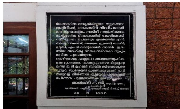
Fig. 1 Memorial stone in Mananchira Public Library and Research Centre

infrastructure. In 1996, as part of a major renovation initiative in the Mananchira area, the old library building was demolished and replaced with a new structure.