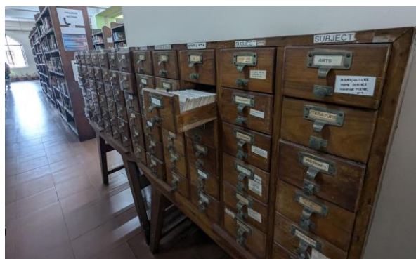
Fig. 3 Card Catalogue Drawers in Mananchira Library

a significant advancement in library management and user accessibility. A card catalogue, traditionally used in libraries worldwide, consists of drawers filled with individual cards, each containing bibliographic information about a specific book, including title, author, subject, and classification details.