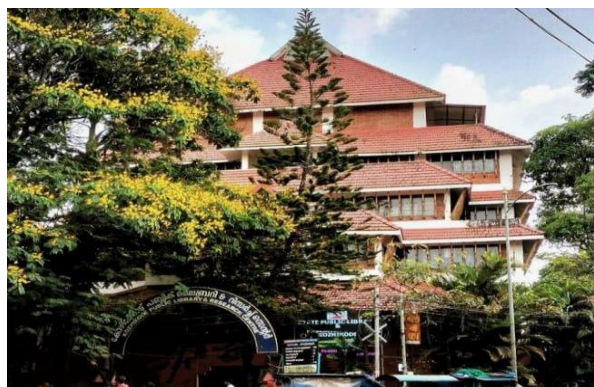
Fig. 4 Front view of the Mananchira Public Library

situated in a 30-cent building, the library eventually relocated to the Motor Vehicle Department premises at Chevayur to accommodate renovations, until its current premises were constructed as part of a larger modernization initiative.