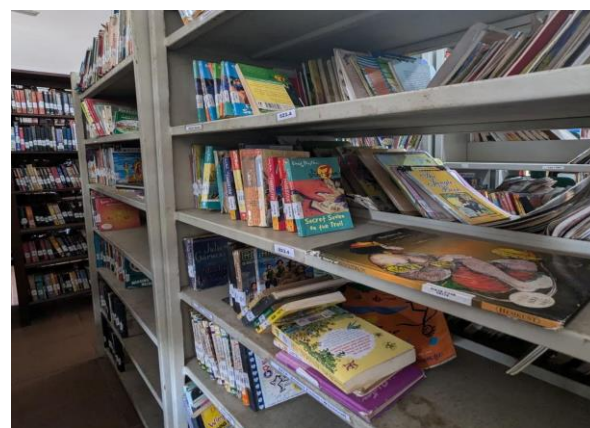
Fig. 9 Shelves for Children's Books

The space is thoughtfully organized, with low, specially designed shelves stocked with picture books, children's literature, and age-appropriate resources that stimulate creativity and curiosity. These easy-to-access shelves encourage children to explore and select books on their own, fostering independence and a sense of discovery. The library has curated its collection to include a variety of genres and themes, aimed at developing reading habits and sparking a lifelong interest in learning from an early age.