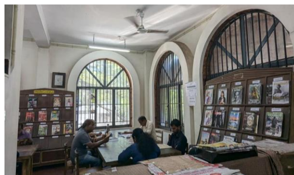
Fig. 6 Reading Space inside Mananchira Public Library

The reading space shown in the images demonstrates an open, shaded area with a tiled roof supported by a robust metal framework. This setup, which offers ample natural light and ventilation, creates an inviting space for readers to enjoy newspapers and magazines. The seating is organized in a communal style, promoting a sense of shared space and intellectual engagement.